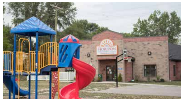
Market Square Horizon Education Center 2500 W. 25th Street, Cleveland, Ohio.

Before opening on 25 TH Street in 2016, Horizon was in the Pilgrim UCC Church in Tremont and had a school-based program at Scranton School (CMSD).