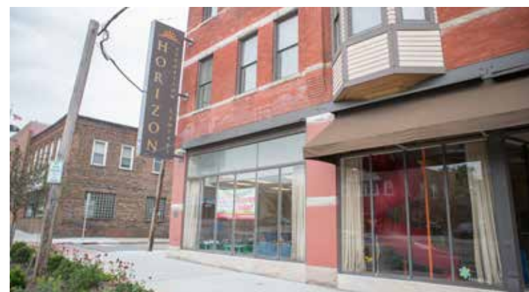
Old Brooklyn Horizon Education Center 4142 Pearl Road Cleveland, Ohio

Before opening on 25 TH Street in 2016, Horizon was in the Pilgrim UCC Church in Tremont and had a school-based program at Scranton School (CMSD).